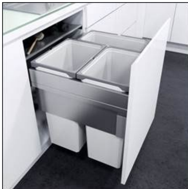
Figure 5.2 Example three bin storage system to be provided within the unit design.

Provision will be made in all residential units to accommodate 3 no. bin types to facilitate waste segregation at source. An example of a potential 3 bin storage system is provided in Figure 5.2 below.