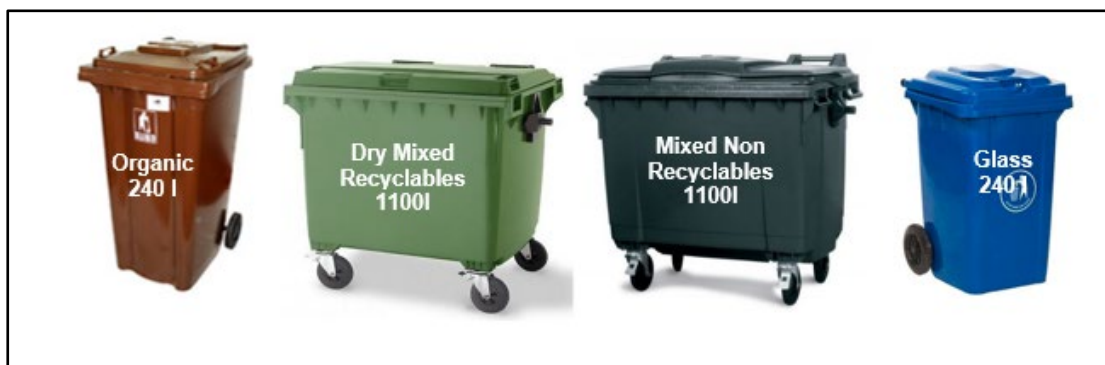
Figure 5.1 Typical waste receptacles of varying size (240 L and 1100 L)

The types of bins used will vary in size, design and colour dependent on the appointed waste contractor. However, examples of typical receptacles to be provided in the WSA are shown in Figure 5.1. All waste receptacles used will comply with the SIST EN 840-1:2020 and SIST EN 840-2:2020 standards for performance requirements of mobile waste containers, where appropriate.