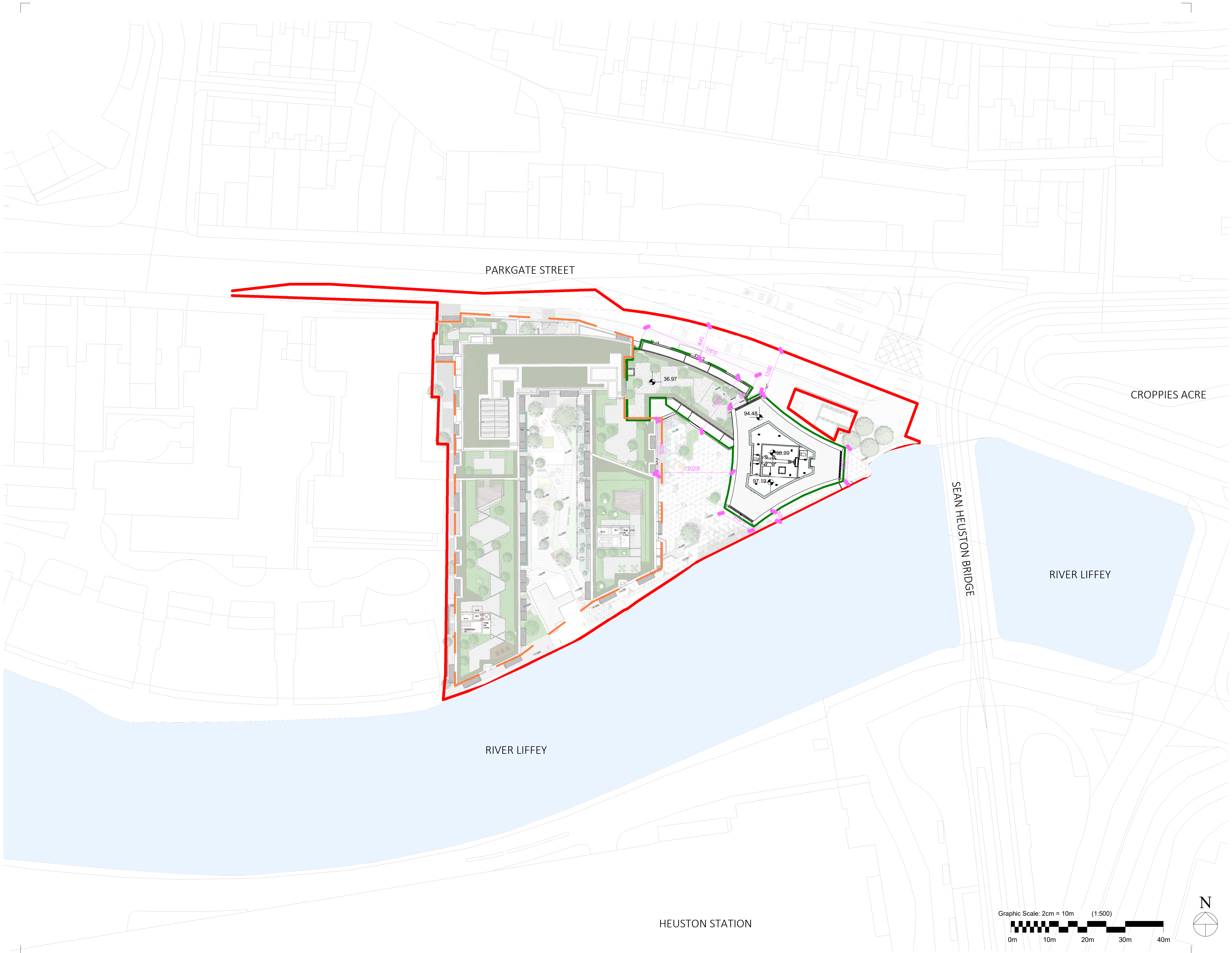
Proposed Site Layout Plan 1 : 500