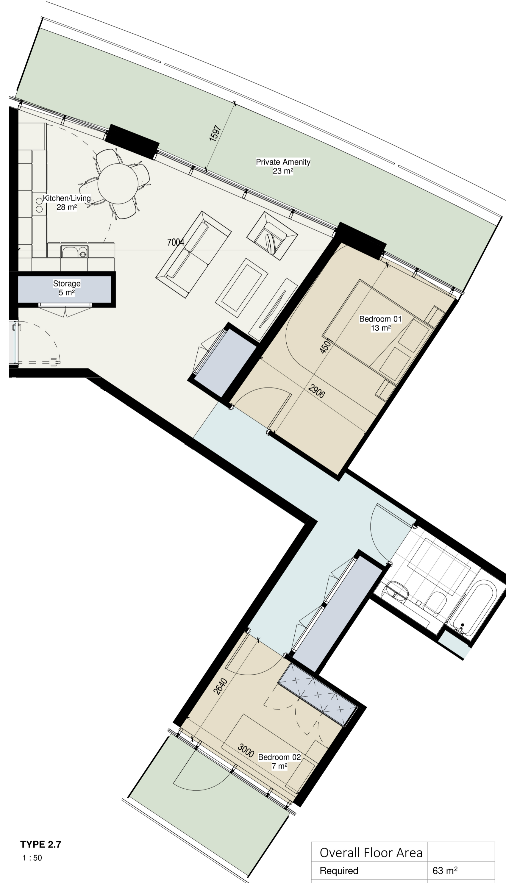
TYPE 2.7 1 : 50