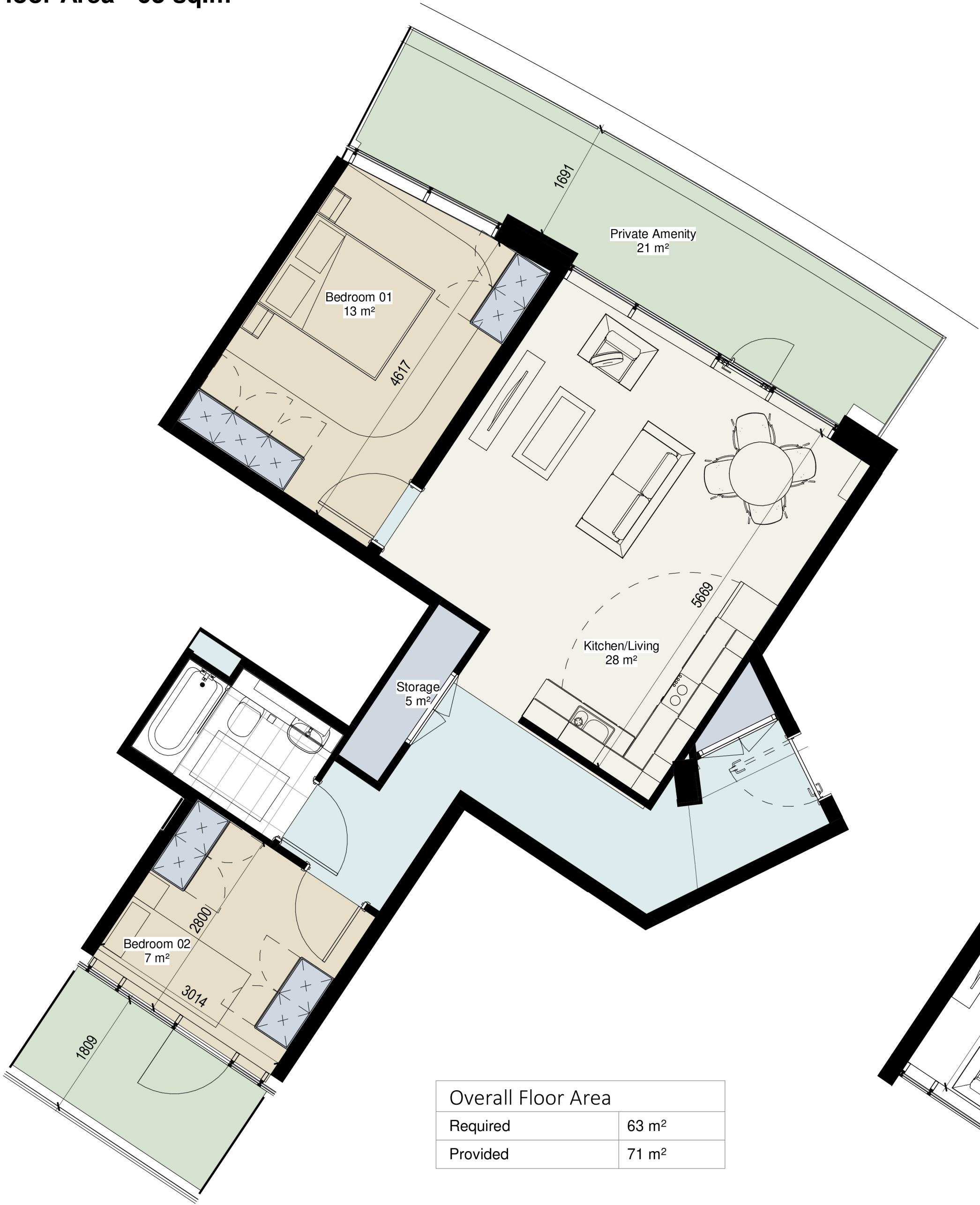
TYPE 2.8 1 : 50