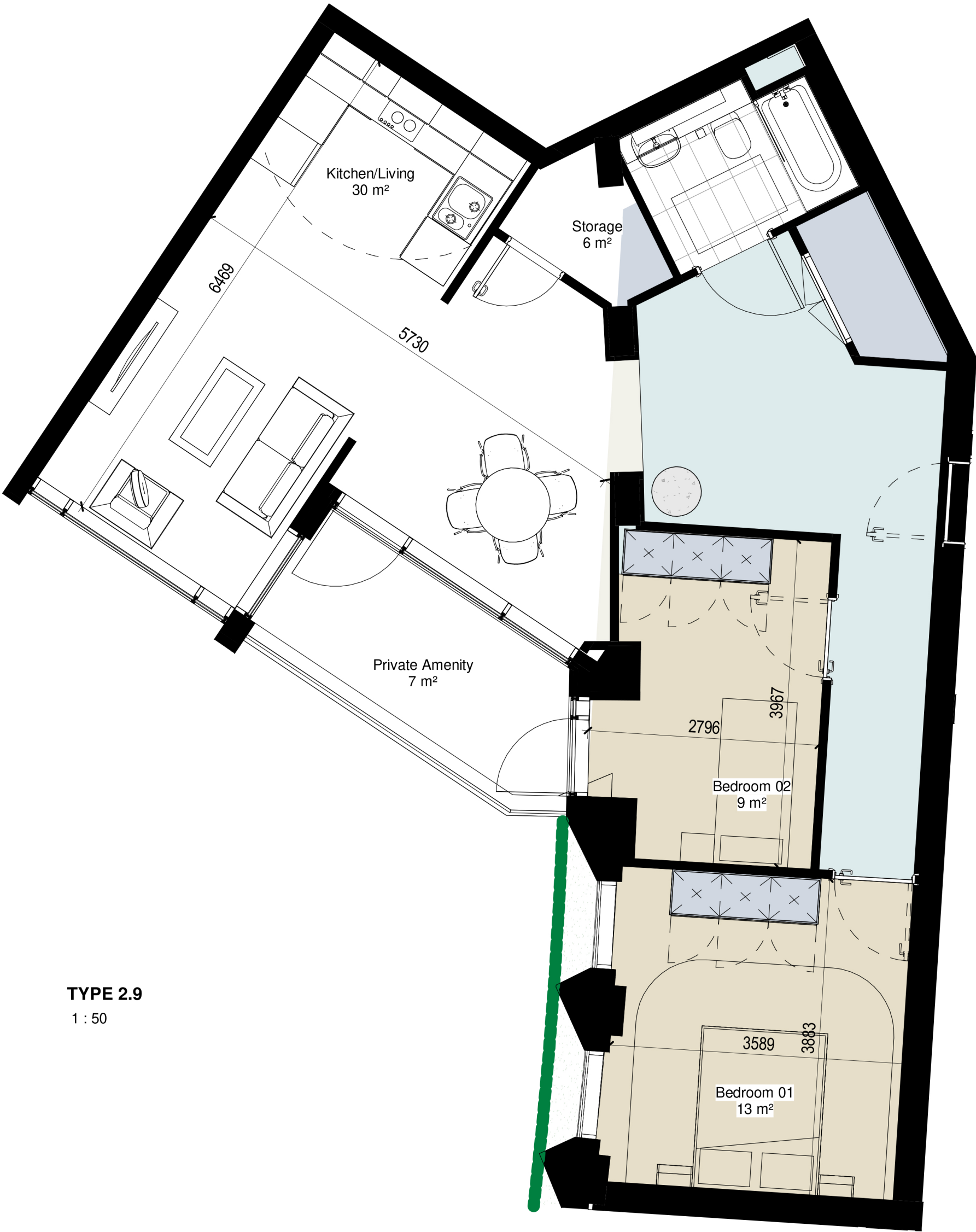
TYPE 2.9 1 : 50